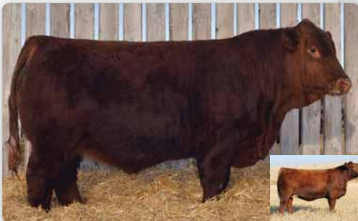
56D - paternal sister

This 3/4 blood bull sure has an impressive hair coat, dark red, dense and fuzzy. His dam has done an excellent job with raising her first calf. We sold a paternal sister to 69E at the 2017 edition of Friday Night Lights to good folks of Hogel Livestock and Richards Cattle. Homozygous Polled