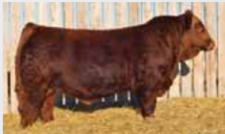
BOBE 45C - Maternal brother