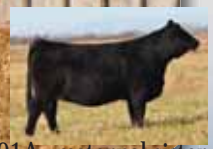
201A- maternal sister

Don't let these younger bulls slip by on sale day. His mother comes from a strong maternal background that everyone loves to have in the replacement pen. A maternal sister to 192E sold to the good folks of Maxwell Simmentals in Friday Night Lights a few years back for $30,000. Homozygous Polled