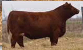
BOBE 112C - Maternal Sister

98X is a real strong uddered cow. She has a tight attachment and perfectly placed little teats. A real nice bred heifer sold to Mud Butte Simmentals in Simmsational a couple years ago. 137E will be a front runner and one of our picks on sale day. Homozygous Polled