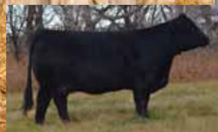
717Y - Dam of Lots 11 & 12

This is our one and only extra age bull to sell in 2018 and he is a good one! 185D is a prime example of built in calving ease combined with huge performance numbers. His full ET brother is 23E. Homozygous Polled