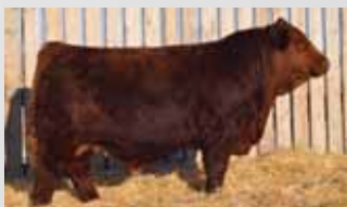
Erixon High Roller - Maternal brother