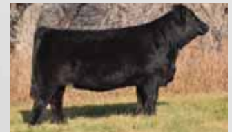
BOBE 10B - Maternal Sister