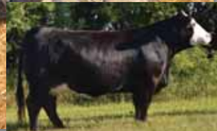
87C - maternal sister

23E has extra style and maternal power. There is tons of structural correctness and quality in this guy. The profile on him is very high end, the way he flows from his shoulder into his elongated neck is a characteristic that is hard not to focus on. He is a sound made individual with large hoof structure, and is fluent in his movement. He has a huge adjusted yearling weight of 1564lbs and will weigh the scale down on sale day. He stood second in a strong class at Agribition. Homozygous Polled