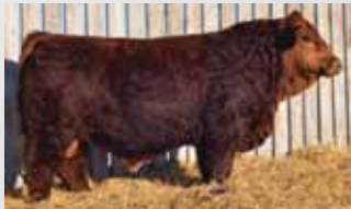
BOBE 91D - Maternal brother