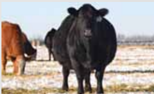
328W - Dam