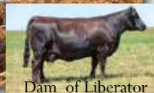
Dam of Liberator