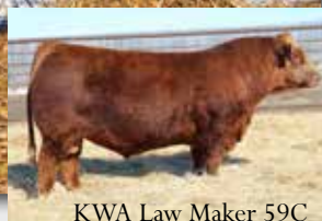
KWA Law Maker 59C

The profile, bone structure, overall mass, and attitude is very high end on this bull. He has a beautiful head shape and great hair. He's the real deal and we think the picture speaks for its self. 347A was a highlight red bred at McMillens the year we purchased her for $16,000.