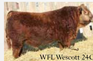
WFL Westcott 24C

We have this large group of Rambler sired bulls in one pen. They sure are an impressive group and are all out of first calf heifers. We literally can't express how happy we are with the Westcott x Rambler cross.