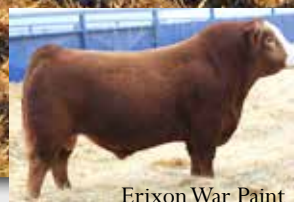
Erixon War Paint

Powerhouse! 29G is put together in a very correct package. He has an exceptional hair coat, big hoof, a huge top and just overall mass. He was part of our show string that we took to Agribition. He was your Reserve Champion Simmental bull calf in the President's Classic show. His dam, 5B has one heck of a good udder and progeny profile. Her first calf was a bull that made his way out to Big Rock Simmentals in BC, a daughter went to KT Ranches and her third calf who is a full sister to 29G sits in the replacement pen. 29G is an extremely well put together package!