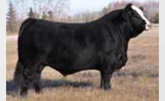
NGDB Domino 36J

Who doesn't love a black baldie! This fella is young, but just take a look at his picture. He has presence, neck extension and muscle shape.