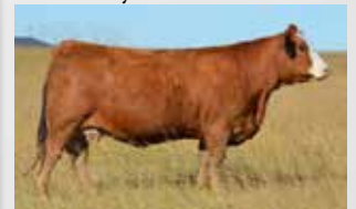
Erixon Lady 202E - dam