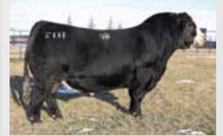
RF No Limits 1112J

We have a large selection of these No Limits bulls for you to sort through. The No Limits bulls were very well received at last years sale. He sits in the top 1% of the breed for both weaning and yearling weight. He also weighed down the scale with a 1548lb ADJYW.