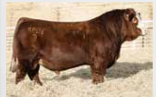
LFE Stratton 3094F - sire

The Stratton calves are soggy made and attractive. We don't think that you could go wrong with adding this Stratton son to your bull battery. This fella is dark red, has exceptional hair and is very easy to like.