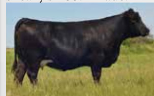
Erixon Lady 48C - granddam

14H is a beauty of a cow with an udder of perfection. As we write these footnotes, she has recently calved and it's exciting to see what her 2025 No Limits calf will do. This will be her third No Limits calf in a row. We feel that 224L will calve quite nicely as he has a moderate birthweight, small head and is really smooth made.