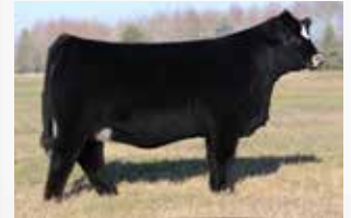
Erixon Mollydooker 2M – same cow family

Here is a direct son of the famous Mollydooker cow. Consistency, udder quality and presence are bred into this pedigree.