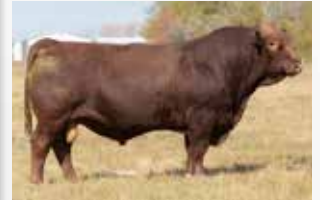
KWA - Shamrock 151H - sire

Calving Ease! The Shamrock calves are born small and easy. 126M is a very proud bull that is suitable for heifers or adding some calving ease into some young cows. His dam, 55K is extremely dark red and ranks amongst the top of our young cows.