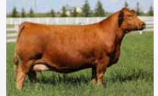
Erixon Darlin' 2.0