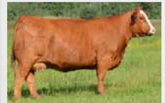
Erixon Lady 31D - granddam