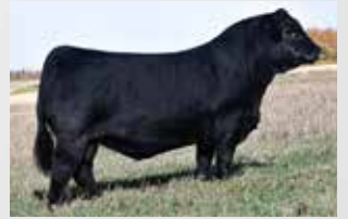
RF Caliber 014G - sire

IJ is a cool marked black Capacity daughter who has been doing a great job for us. If you're looking to add some extra growth and length of spine to a calf crop mark 120M down.