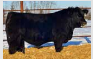
Erixon Walk The Moon 25j