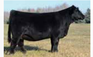
Erixon Darlin' 82M