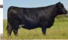
Erixon Lady 48C - Dam

This fella has looked the part since he was a few months old and has gotten better and better with time. He posted a 1548lb adjusted YW and is in the top 1% of the breed for WW and YW. 121M has been raised by another great cow who looks the part and can raise the good ones. A maternal sib sold in the prestigious Cobra event. We think the picture of his dam and maternal sib show you the depth of quality in his pedigree. If you want to raise females, make sure you mark this fellow down.