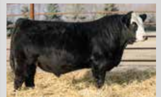
Erixon Lad 9L - full brother

55G is a gorgeous uddered Capacity daughter that calved again right at the beginning of January. The Capacity females have proven themselves time and time again to be highly maternal cows. The Capacity x No Limits cross worked out exceptionally, a full brother was one of our high sellers last year. We are excited for the future of 8M as he has many outstanding attributes to offer the industry.