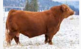
Mader Walk The Line - sire

13H is a huge ribbed, good haired red baldie momma. A full sib to 222L calved in January and is absolutely gorgeous. The picture of 222L speaks wonders for this bull, he is good haired and well balanced. Everyone will have a double check mark beside his lot number when you mark your catalogue on sale day.