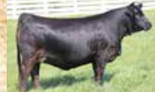
Erixon Lady 134E - maternal sib