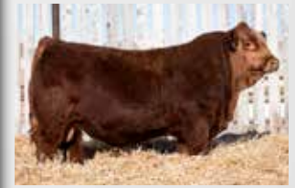
NUG Eclipse 302K - sire

Good old 111Z has paid her way over the years and this bull is no exception to that statement. He has a real nice splash of white on his skull, just like his dam.