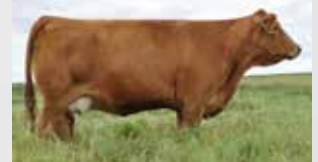
Erixon Lady 2P - great granddam

We absolutely love this bull! He's been at the top of the pack since the beginning. Erixon Eight Ball 19M is a true powerhouse. He's extra long bodied, well muscled, big hooped and pushes the scale down. He also has a pretty cool look to him with that extra neck extension. On the cow family side of things, his dam goes back to one of our original flush cows who helped put us on the map, Erixon Lady 2P. This young Epic cow hit it out of the park on this black baldie stud. He truly is a special one in the pen this season.