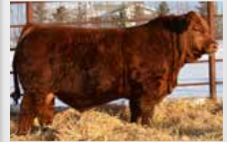
Erixon Boss 125K - sire

Good old 513C has raised another highly marketable calf. She has been extremely consistent over the years and we did take the opportunity to do a flush on her in her younger years. 42M pictured like a champ and has dense fuzzy hair.