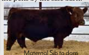
Maternal Sib to dam

Calving Ease! Take advantage of these Simmental calving ease bulls when you can. We do have a real solid group of bulls that are suitable to breed your heifers. The dam of 92M is a maternal sib to Erixon Element 17J who the folks at Ashworth Farms have used successfully on heifers. These bulls spend from weaning until mid Nov out on a 15 acre field west of the yard and are then moved into the pens by the sale barn.